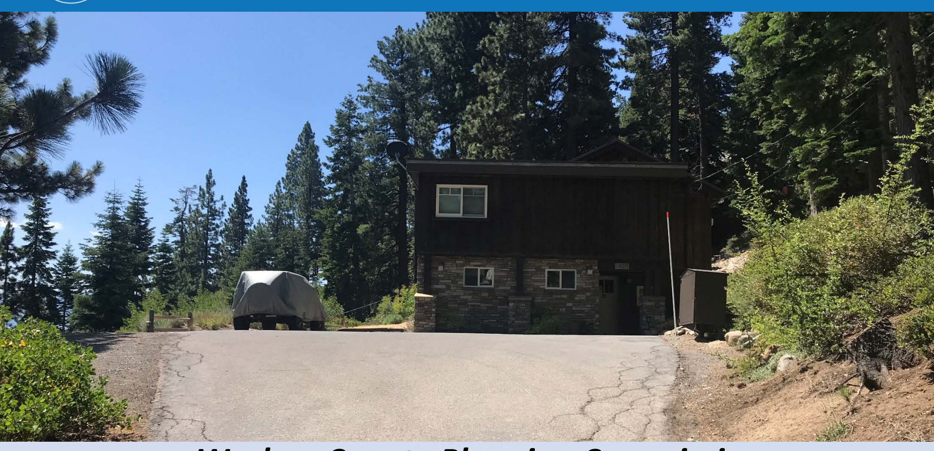
Washoe County Planning Commission September 1, 2020